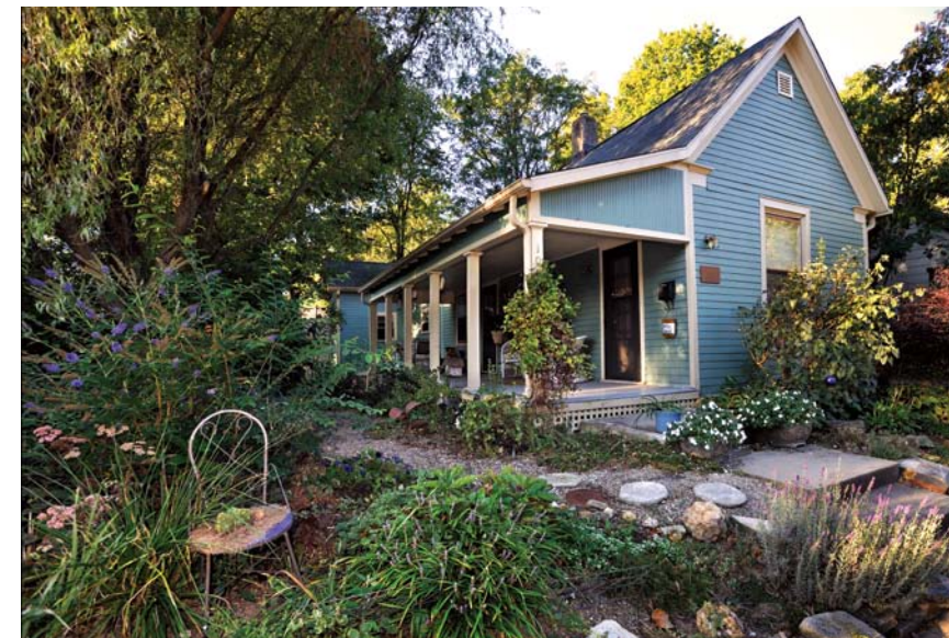
Two homes on West 7th Street restored by Bloomington Restorations' Affordable Housing Program.