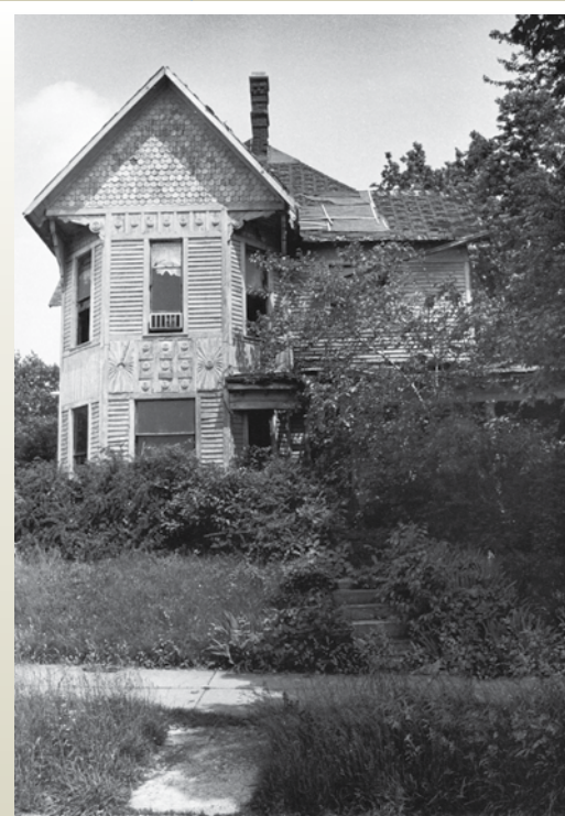
By the late 1970s the Morgan House, at the corner of 10th Street and Walnut, was completely overgrown. A large hole in the roof exposed the interior to rain and snow, which had severely damaged plaster on the walls and ceiling. The front porch, not visible in this picture, was rotten and on the verge of collapse.

Close your eyes and try to picture Bloomington without its historic buildings. No courthouse on the Square. No Buskirk-Chumley Theater. No Showers complex at City Hall. Now try to imagine the town without its picturesque old neighborhoods—the dignified homes of Elm Heights, the eclectic houses of Prospect Hill, the modest cottages built for railroad and factory workers on the Near West Side.