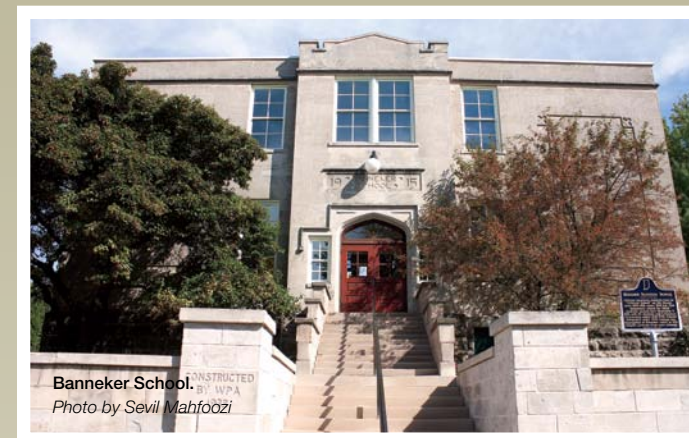
Banneker School.