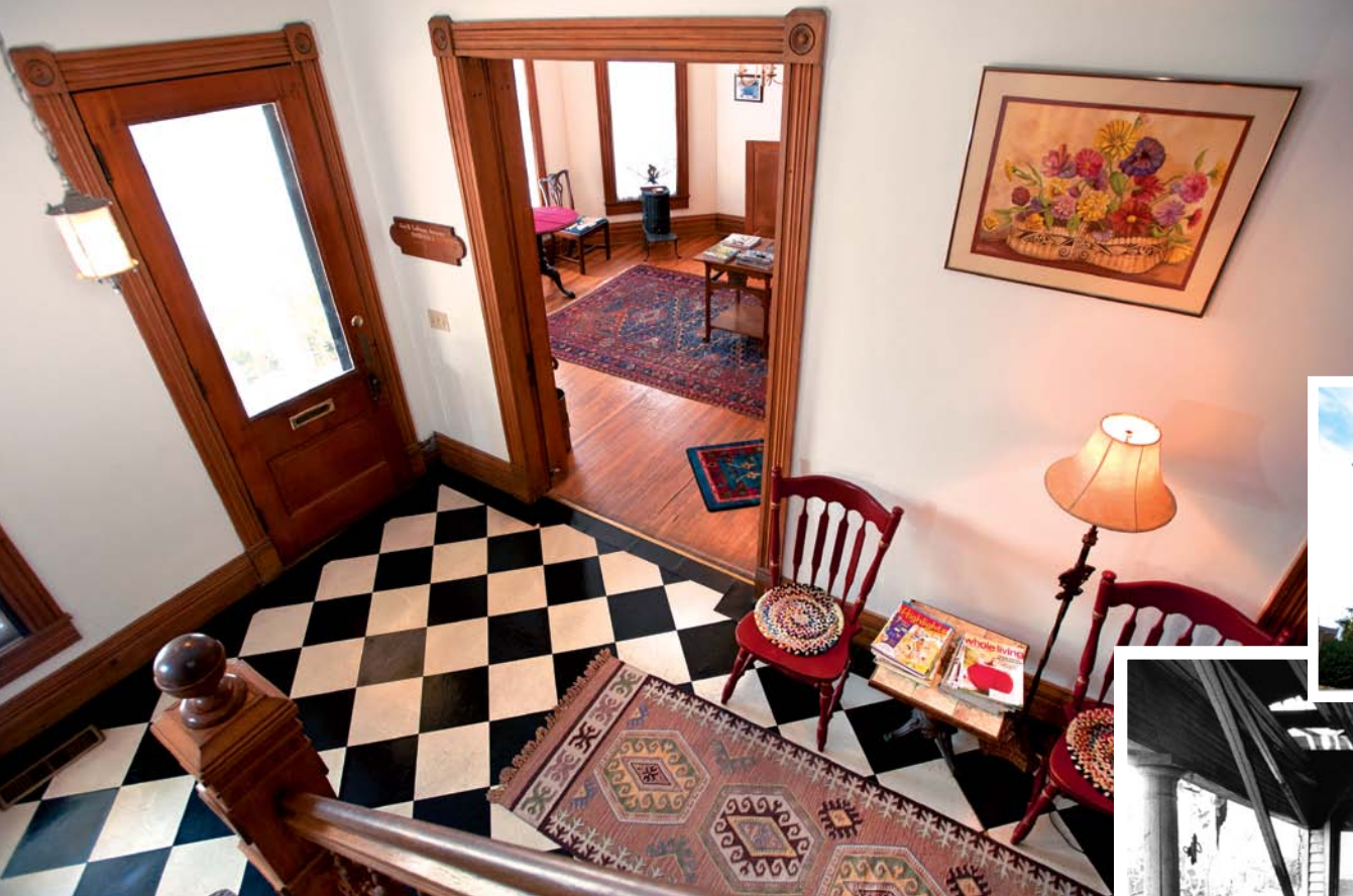
In the reception area of the Morgan House, the original oak staircase, doors, trim, and walls have been restored.